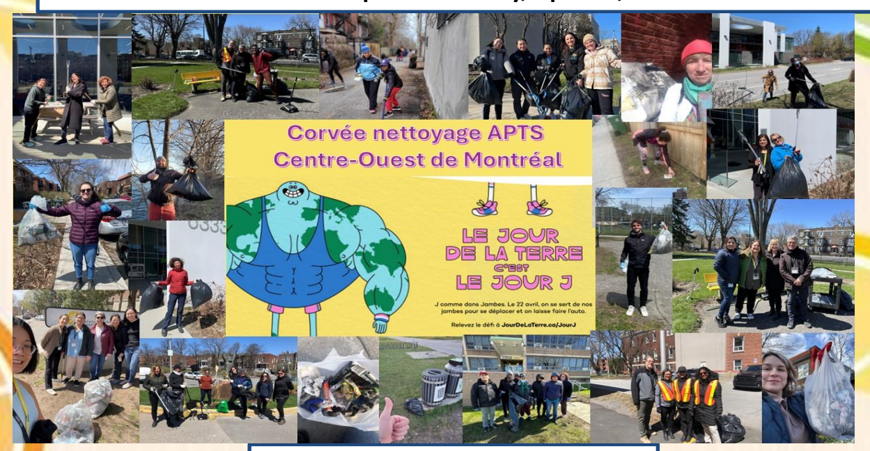
May 14, 2024 Union Council

APTS cleanup for Earth Day, April 22, 2024